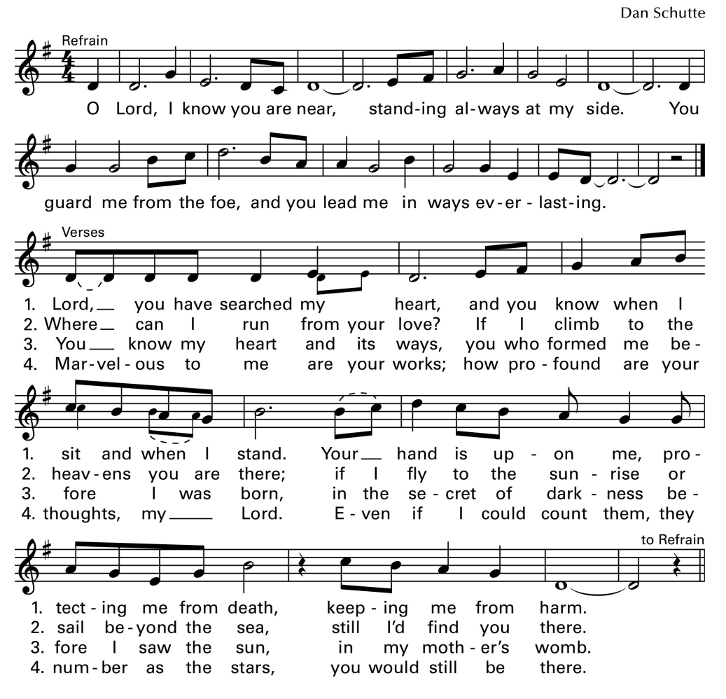
Text based on Psalm 139. Text and music © 1971, 2008, OCP. All rights reserved.